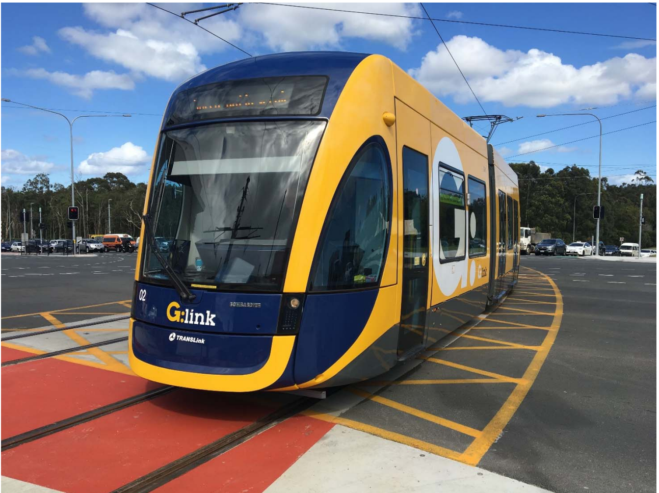
TEST TRAM AT OLSEN AVENUE, PARKWOOD

Subscribing to receive project updates is a convenient way to obtain information about the project and work happening in your area. To subscribe, simply visit our website and look for the 'sign up form' on the 'contact' page.